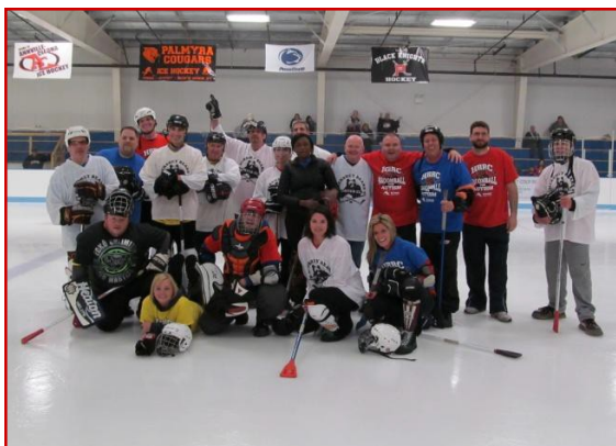
2014 Celebrity Participants