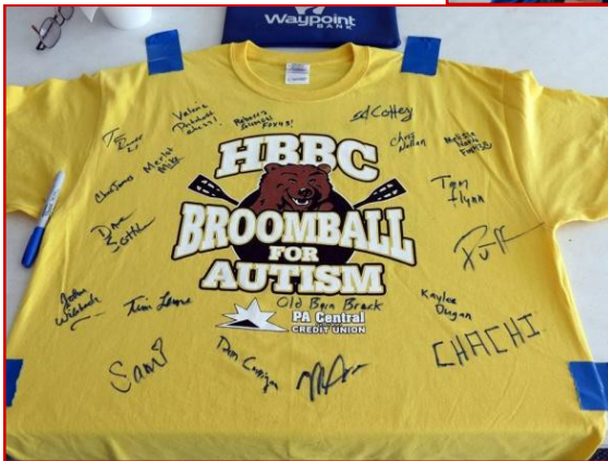
Team NHS Jersey, Autographed by the celebrities and raffled off